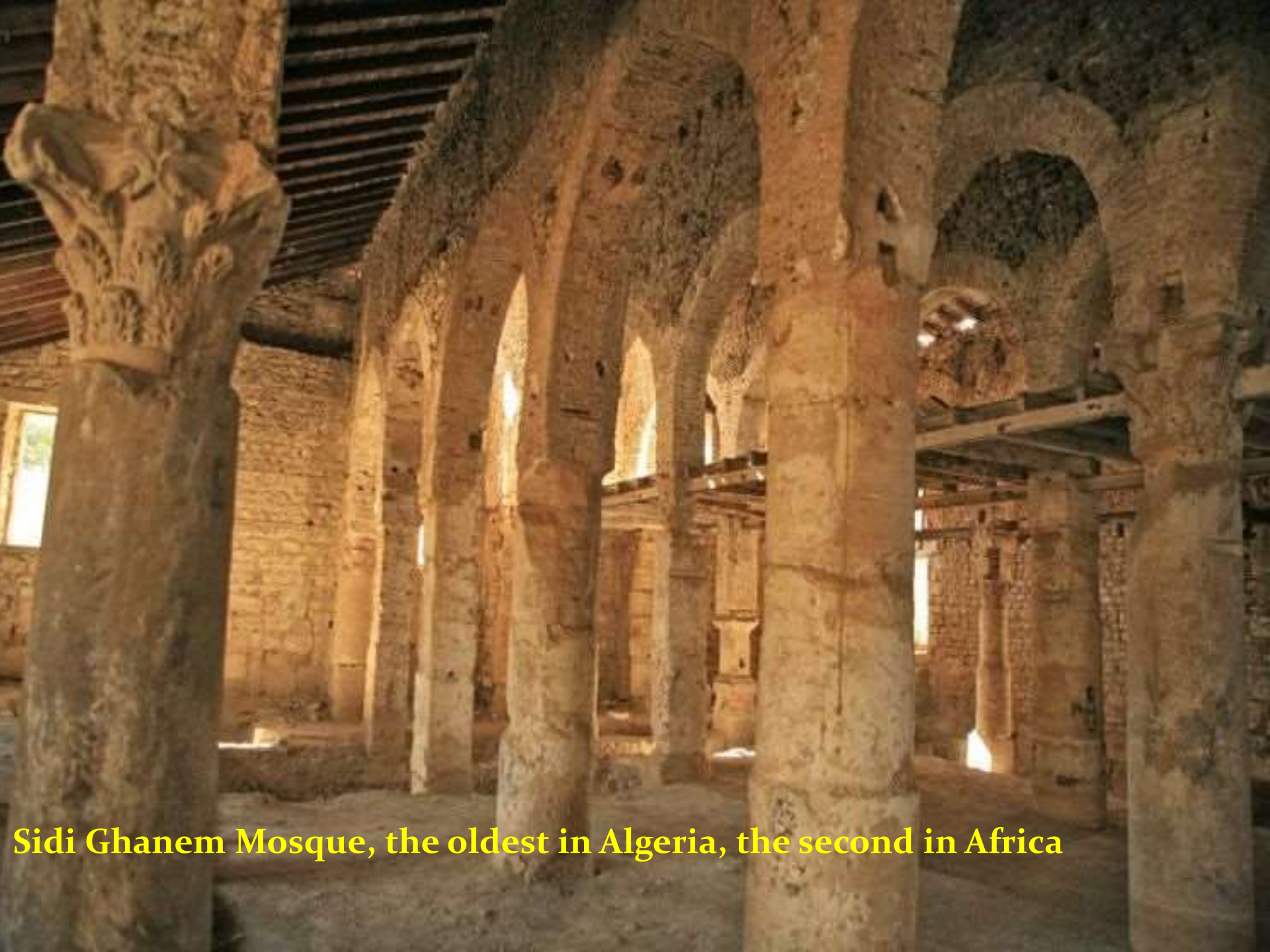
Sidi Ghanem Mosque, the oldest in Algeria, the second in Africa