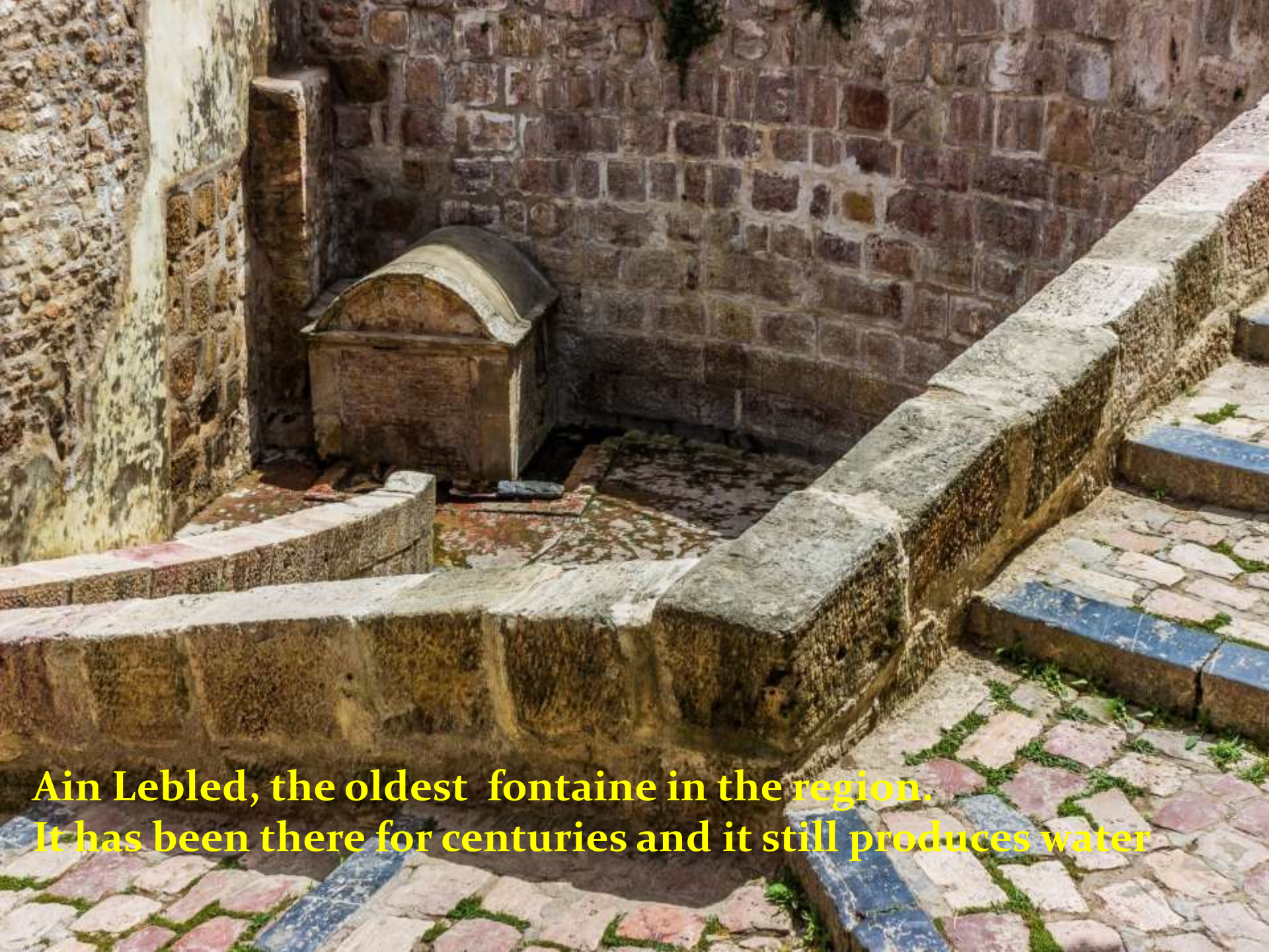
Ain Lebled, the oldest fontaine in the region. It has been there for centuries and it still produces water